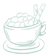
Hot Chocolate (Milk)