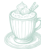
Nutella Hot Chocolate (Milk, Hazelnuts)