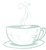
Flat White (Milk)